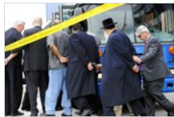
Going Inside a 'Jersey Sting'