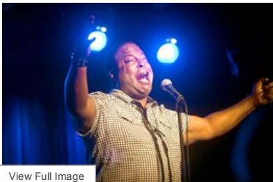
View Full Image

"Anyone Can Whistle" has always seemed like one of Steven Sondheim's most pleasant and least complicated songs—it's often performed on all-Sondheim programs as a respite from heavier arias, like most of "Sweeney Todd" or "Passion." But at Sondheim Unplugged at the Laurie Beechman Theatre on Monday, Len Cariou made it clear what a deceptively complex piece it is. "What's hard is simple," the lyric goes, "what's natural comes hard." The act of "whistling" becomes a metaphor for the difficult act of fully living life, showing that "being free" is something that has to be learned. In Mr. Cariou's practiced hands, "Anyone Can Whistle" is a song about being alive, no less so, in fact, than "Being Alive."